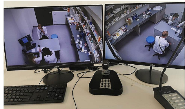
Fig. 1 The view of the pharmacy during the simulation scenario role-play from the perspective of the teacher

We designed three scenarios during which students played the roles of a pharmacist and a patient. The scenarios are presented in Table 1.