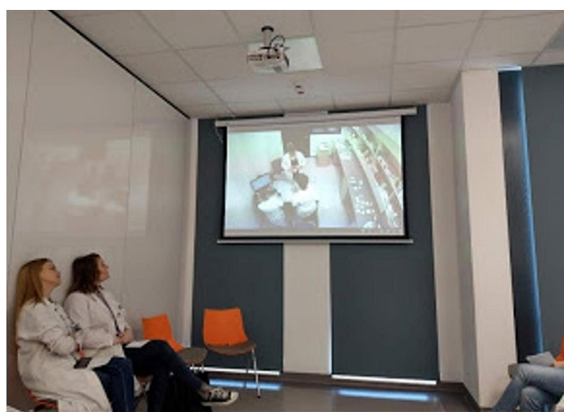
Fig. 3 A debriefing room during a role-play scenario

the same order, aspects that could have been performed differently were discussed [27].